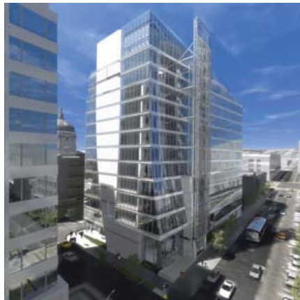
Worrell Water Technologies' onsite Living Machine system treats and recycles wastewater for reuse.